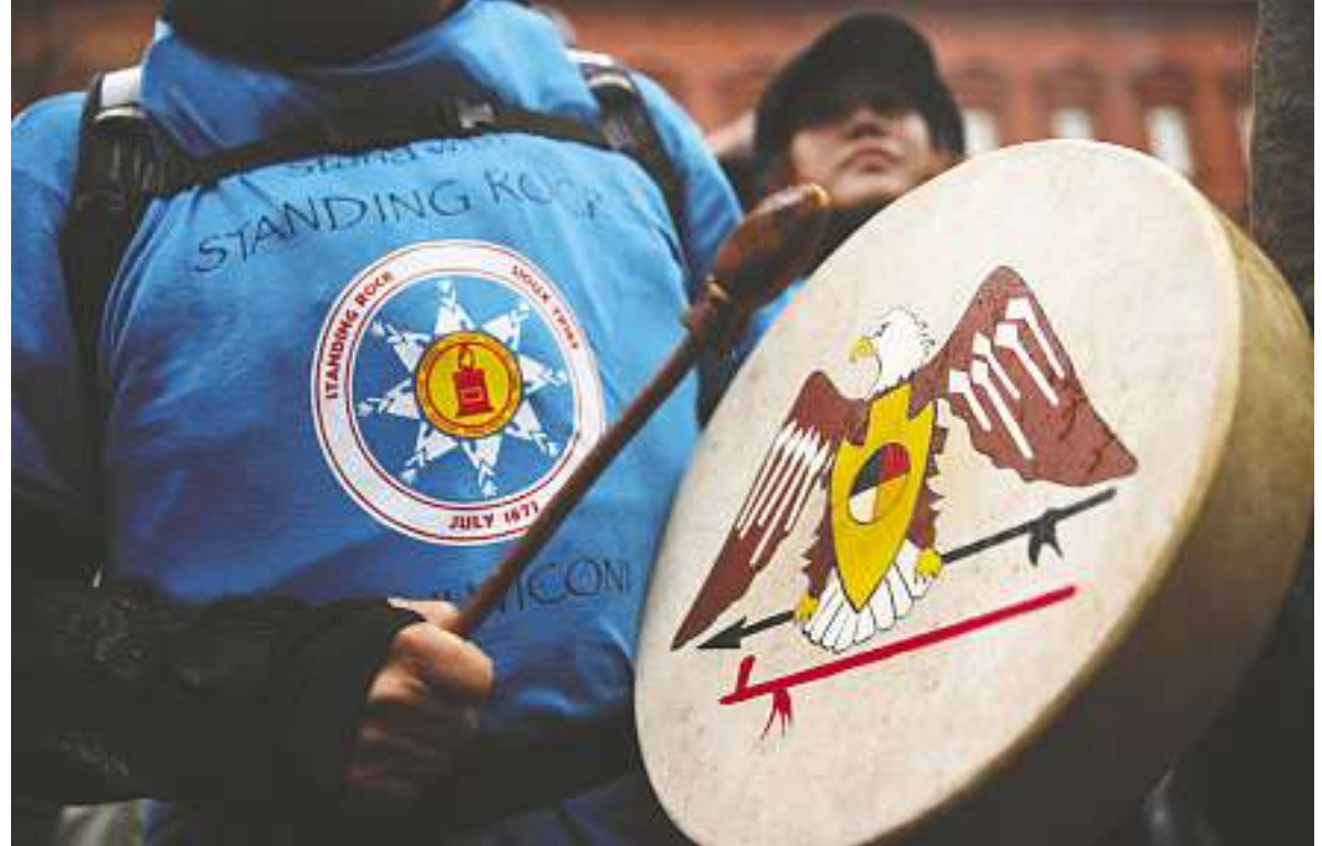
An activist protests gainst the Dakota Access pipeline in 2017 in Washington. Energy Transfer is appealing a ruling suspending pipeline operations until environmental reviews are done.